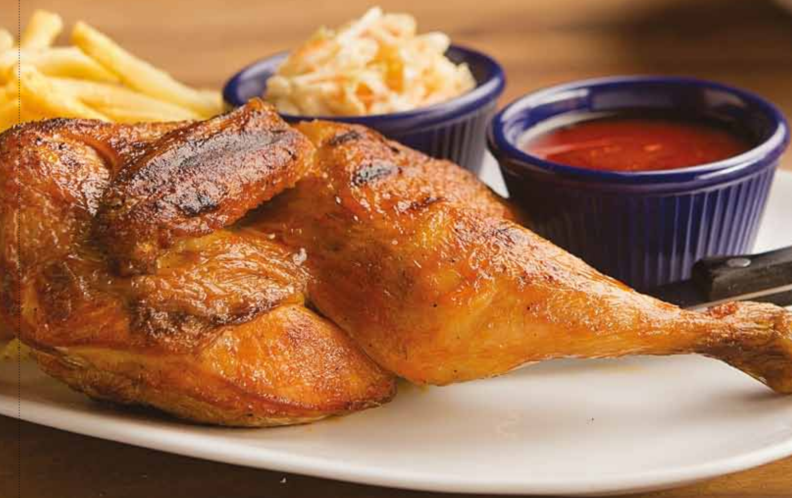
BARBECUED HALF CHICKEN