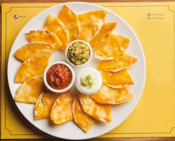
SUPER-DUPER CHEESE NACHOS