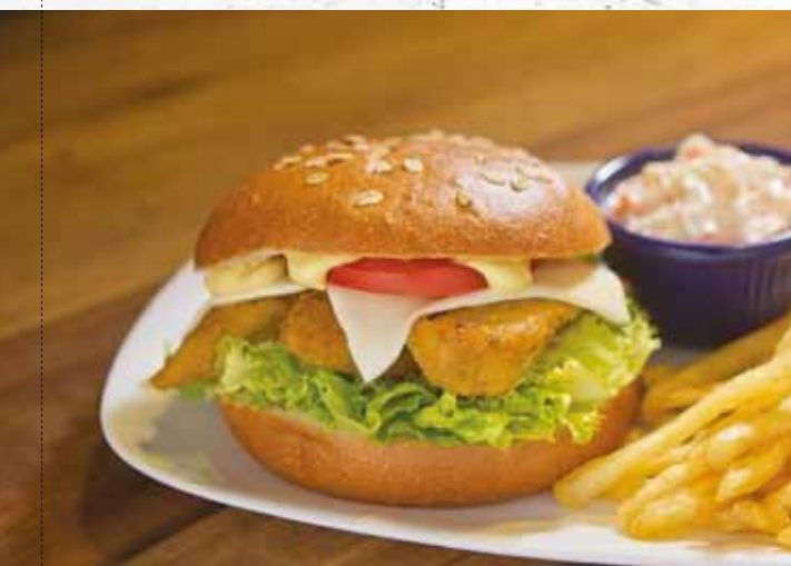
THE SWEET CHICK

grilled chicken fillet, american cheese, lettuce, tomato, onions, jalapenos and our buffalo suicide sauce