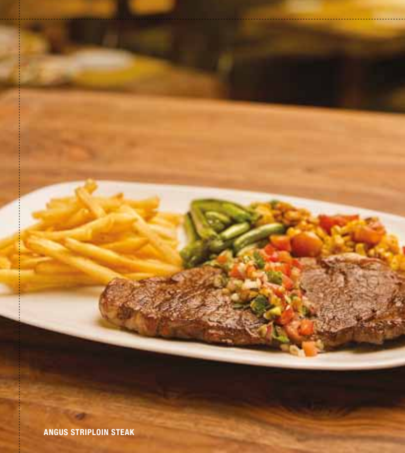
ANGUS STRIPLON STEAK