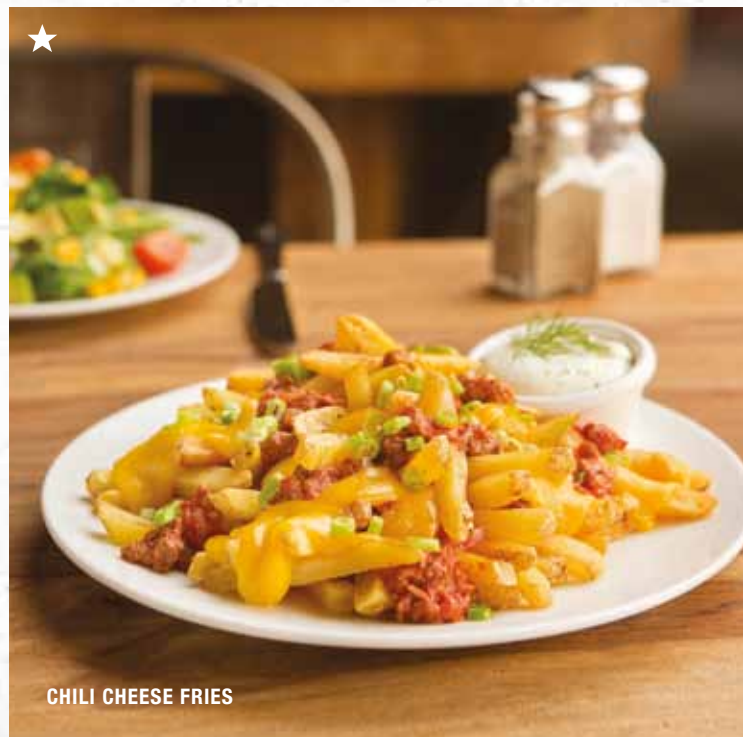
CHILI CHEESE FRIES

we've got them! warm, melting and crisp fried, served with thousand island sauce